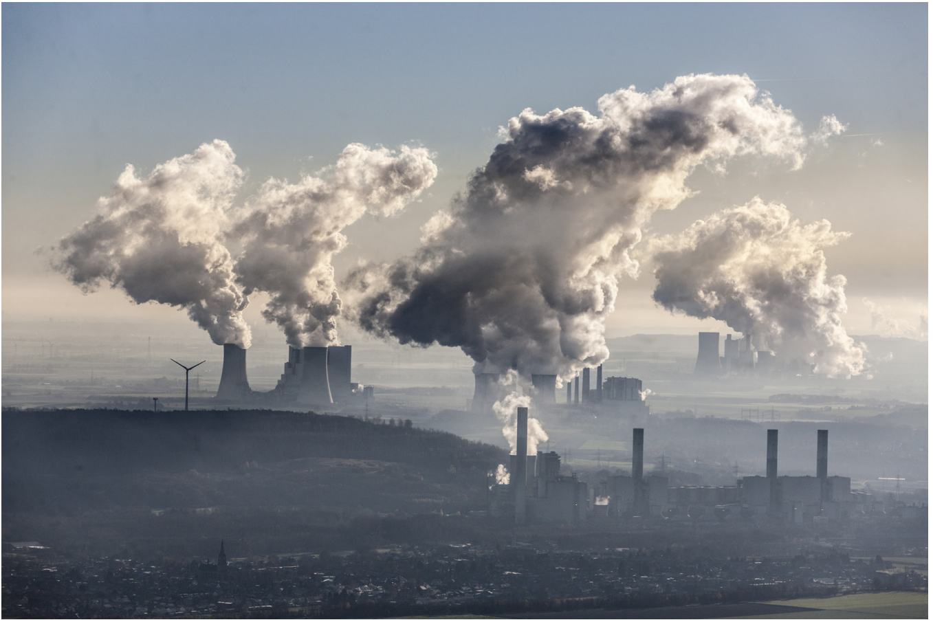
Aerial of Coal Fired Power Plants in Germany

sector who are also exiting coal and have lowered both their absolute and relative criteria. When it comes to the former, financial institutions like Allianz, Generali or Ostrum are using lower absolute thresholds than the Fund and already exclude companies that produce over 10 million tons of coal per annum or operate over 5 GW of coal-fired capacity. For the latter, it is increasingly common to operate with relative thresholds between 0%-10%, as used by Asia's leading insurance company AIA, the Norwegian pension fund KLP and the bank Storebrand. 21 Storebrand has even critiqued the Fund and asked them to strengthen their criteria. 22