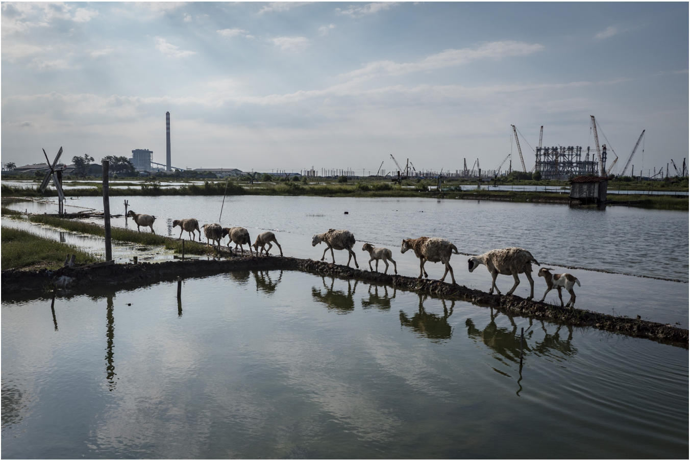
Sheeps near abandoned salt ponds near a new construction of the Cirebon coal power plant 2. The Oil Fund is linked to the expansion of this coal fired power plant (see section 4.2)