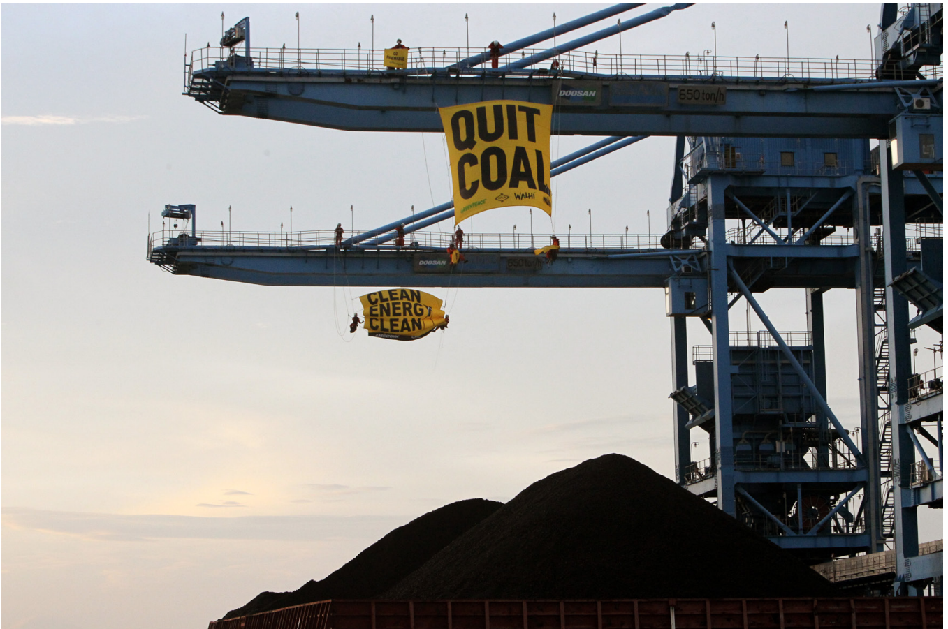
Indonesian activists protesting the Cirebon Coal Power Plant in Indonesia.

The Oil Fund is linked to the expansion of this coal fired power plant