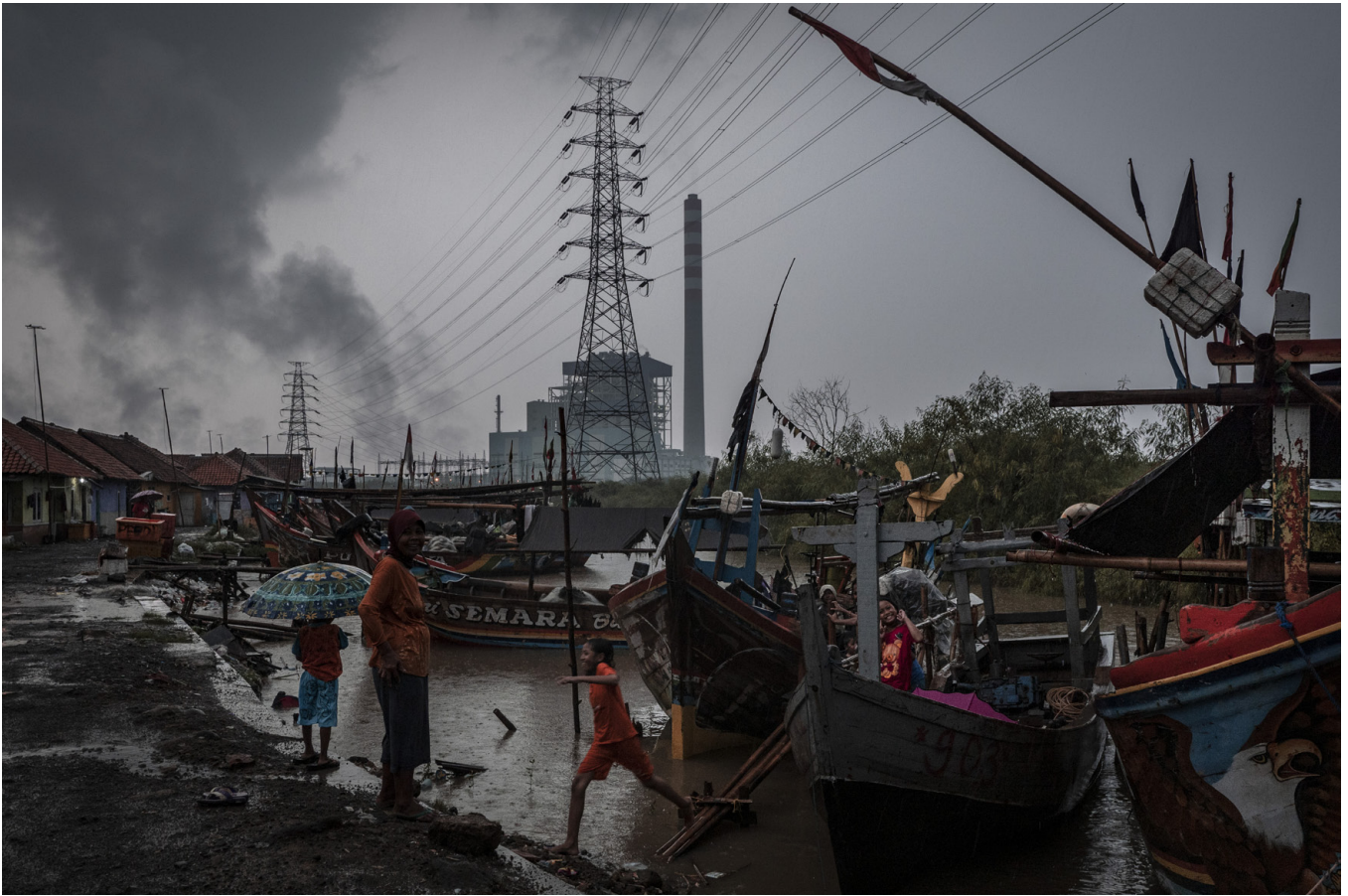
View of the Cirebon power plant from Waruduwur village in Indonesia.

The Oil Fund is linked to the expansion of this coal fired power plant