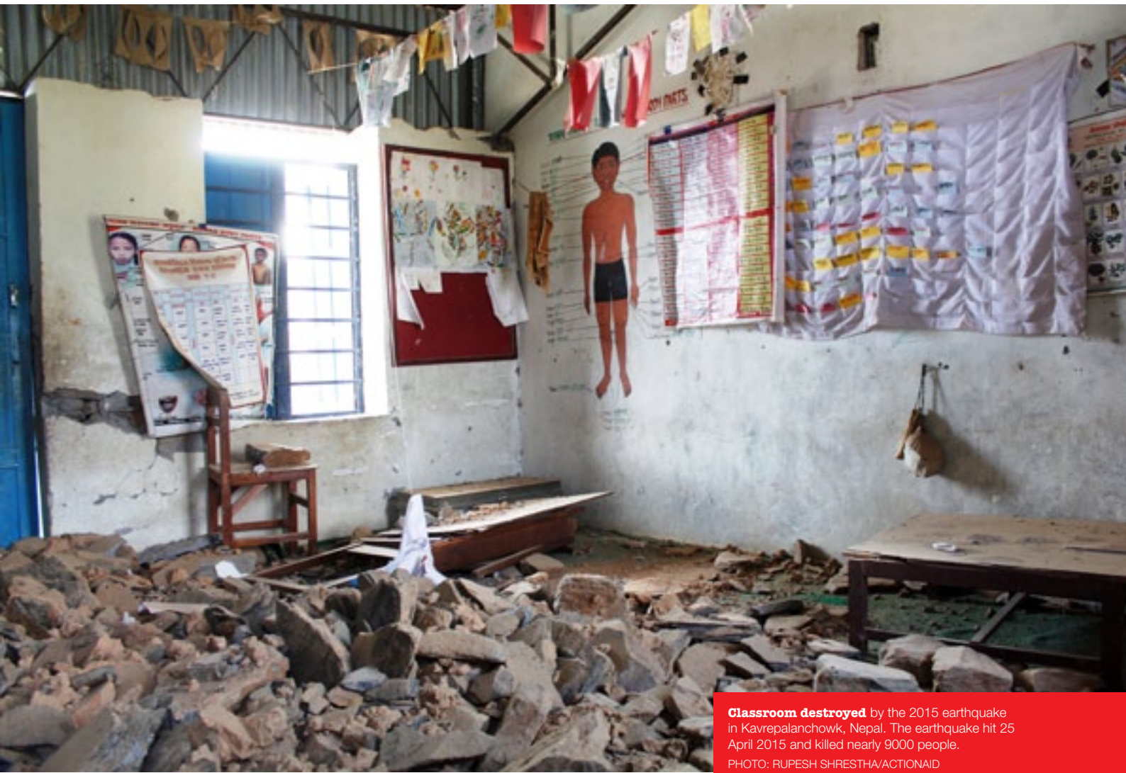
Classroom destroyed by the 2015 earthquake in Kavrepalanchowk, Nepal. The earthquake hit 25 April 2015 and killed nearly 9000 people.

emergency occurs. Critically, to avoid the misuse of young people as labour in crisis response, the Future of Humanitarian Surge report found that one of the key reasons to build such a network ahead of time is to put in place robust HR guidelines and management. 41 This must ensure young people's rights, safety, safeguarding, fair compensation and skills development are all taken into consideration, and a system is in place to manage these provisions in times of disaster and deployment.