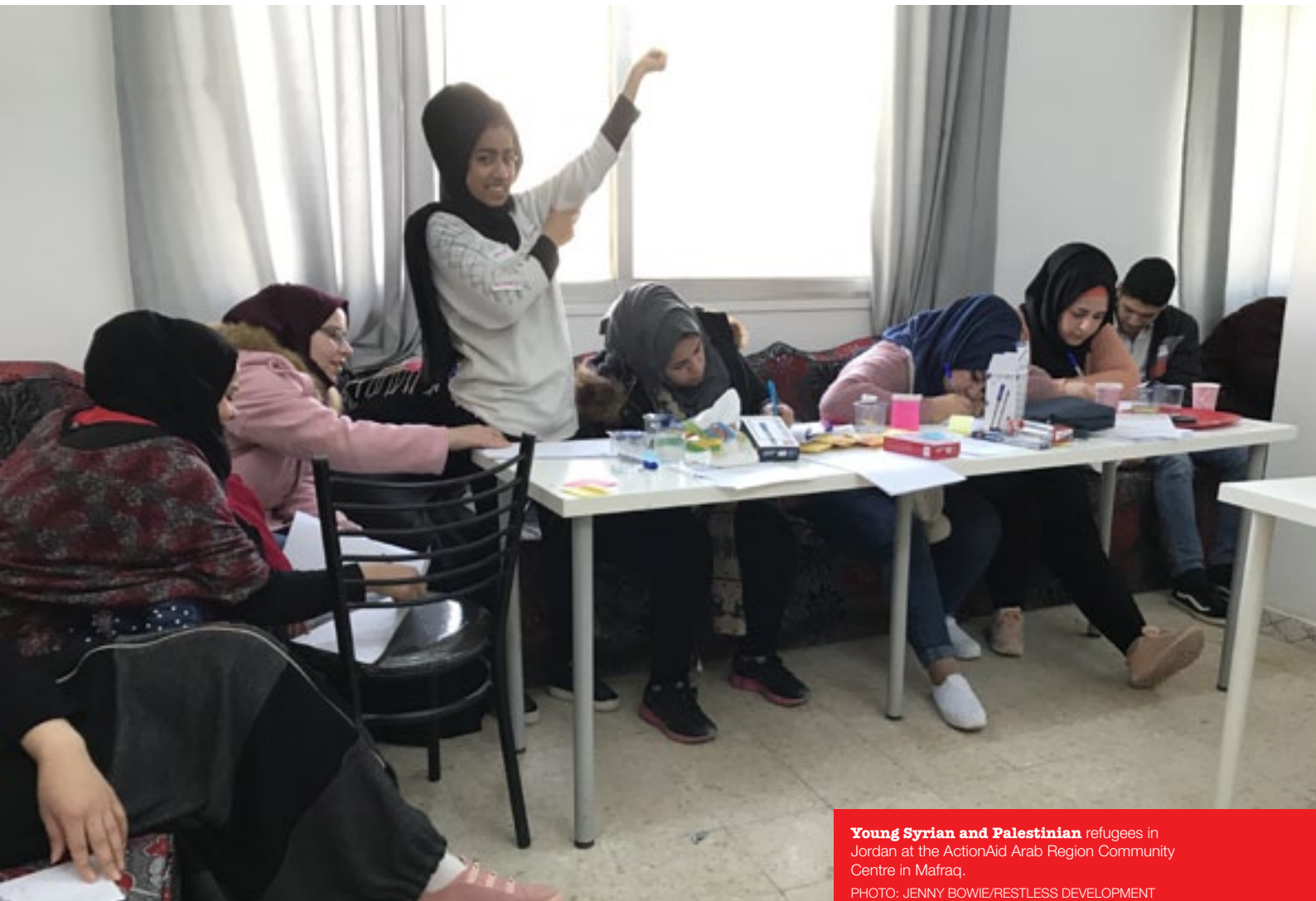
Young Syrian and Palestinian refugees in Jordan at the ActionAid Arab Region Community Centre in Mafraq.

to stake their lives because of it. We asked – if you’re telling someone to drop your guns, what are you giving them in return? What are we offering young people in return financially, so they don’t turn to these negative means? For this reason it can be critical to have more funding in the sector for livelihood programmes.”