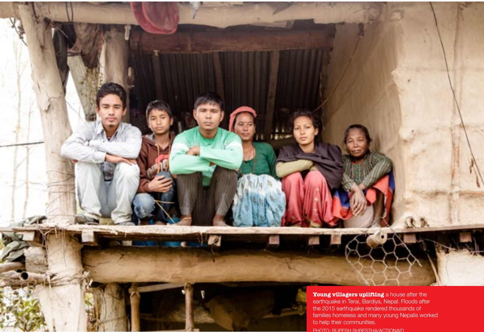
Young villagers uplifting a house after the earthquake in Terai, Bardiya, Nepal. Floods after the 2015 earthquake rendered thousands of families homeless and many young Nepalis worked to help their communities.